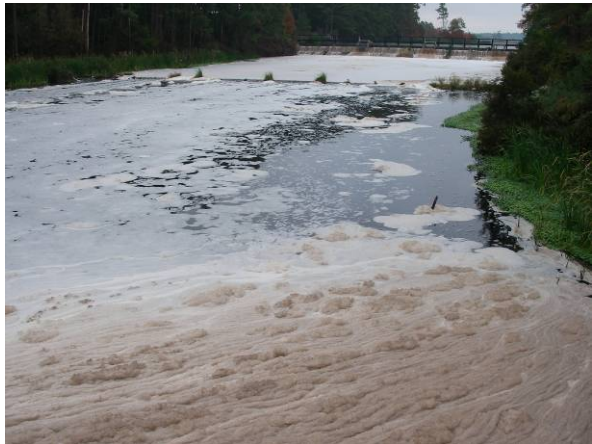
Coffee Cr. looking upstream Nov. 15, 2010