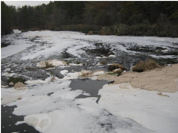
Coffee Cr. looking downstream Dec. 17, 2010