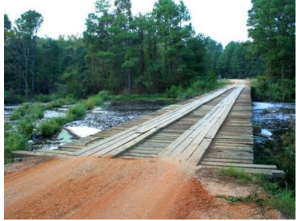
Coffee Cr. at Co. Rd 11 bridge Feb. 13, 2006