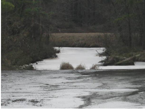
Coffee Cr. looking downstream Feb. 16, 2011

All photos unless otherwise noted are from Ashley County Rd. 11 (aka Ramsour Rd.) located just downstream from the mill pond discharge (Outfall 001)