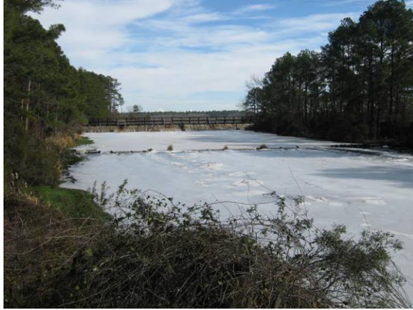
Coffee Cr. looking upstream Jan. 20, 2011