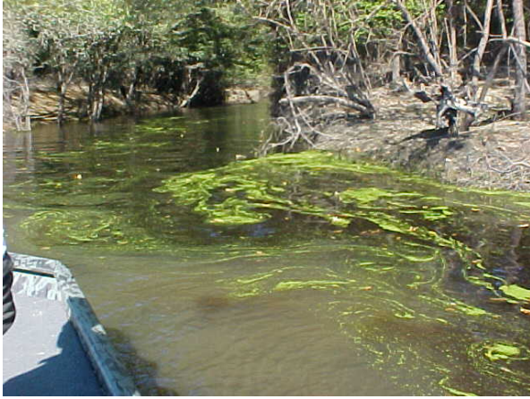
Coffee Cr. into Ouachita R. Nov. 13, 2008