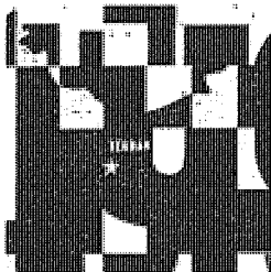
Op-Ed: Iran's Plan B for the Bomb