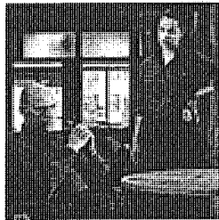
Killers Who Just Won't Lighten Up

Editorial: Apple Pays Dearly for Price-Fixing In the e-book wars, the Justice Department has not addressed the anticompetitive force that is Amazon.