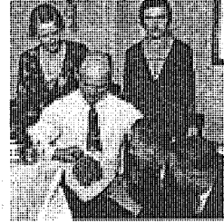
Not for the Family Album