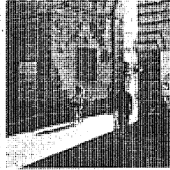
36 Hours in Lecce, Italy

Editorial: Apple Pays Dearly for Price-Fixing In the e-book wars, the Justice Department has not addressed the anticompetitive force that is Amazon.